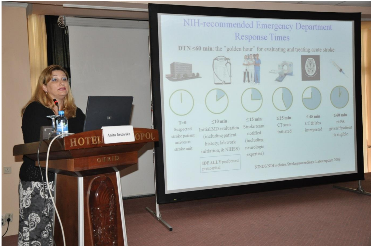
Prof Arsovska about time window in treatment of stroke