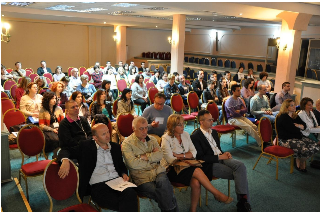
The Audience is listening